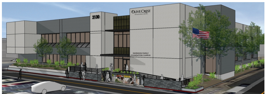
We're renovating and expanding our Children and Family Resource Center and renaming our Santa Ana location the Swenson Family Foundation Campus