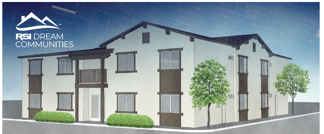
Our new on-campus apartment complex is being built by RSI Communities and is expected to open in winter 2025

The newly named campus includes the new apartment homes