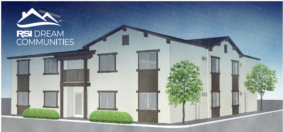
Conceptual Rendering by BSB Design and the builder, RSI Dream Communities

This initiative is about more than new facilities. In addition to stable housing, all teens living in our facilities will learn life skills by participating in our Operation Independence (OI) program, which provides customized 24/7 support to ensure career and college success, break down barriers to employment, and address emotional wounds that would otherwise be carried into adulthood.