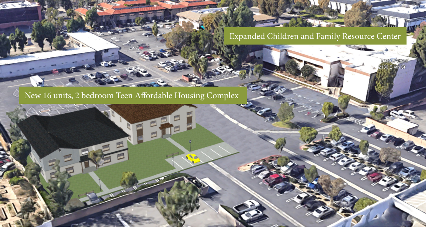
Site Location: Olive Crest, 2130 East Fourth Street, Santa Ana, CA 92705

Rendering of the new 16-unit teen affordable housing complex at the current Olive Crest in Santa Ana location. The new facility will be donated and built by RSI Dream Communities .